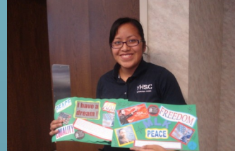
Milwaukee AHEC gets creative