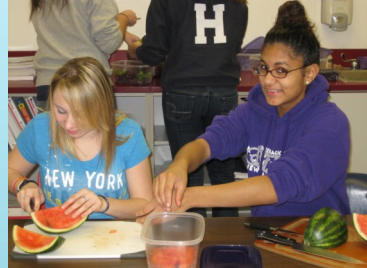
Northern New Hampshire AHEC YHSC member making nutritious meals