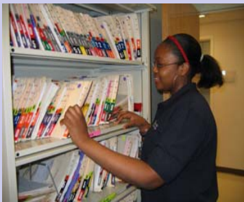
Youth Health Service Corps student volunteering at her local community health center.

The YHSC program received a generous grant from the Corporation for National and Community Service: Learn & Serve America. Through this grant, high school students across the nation will implement health care related service learning projects in their communities.